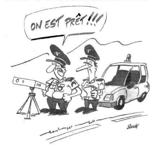
Fig. 11 – Police radars ready for the space litchi, due to fly over La Réunion at terrific speed on 02/08/07 – Drawing is contributed by Souch in Journal de l'Île de La Réunion

19h52: Le letchi de l'espace passera au dessus de la Réunion à une vitesse folle