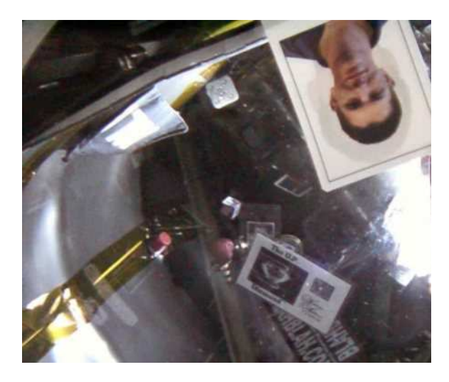
Fig. 3 – First image of Orbital Litchi floating in space on the 5 July 2007

"I was on vacation in a deep countryside location with no city lights around... I got out fifteen minutes before the expected time to get my eyes accustomed to the darkness