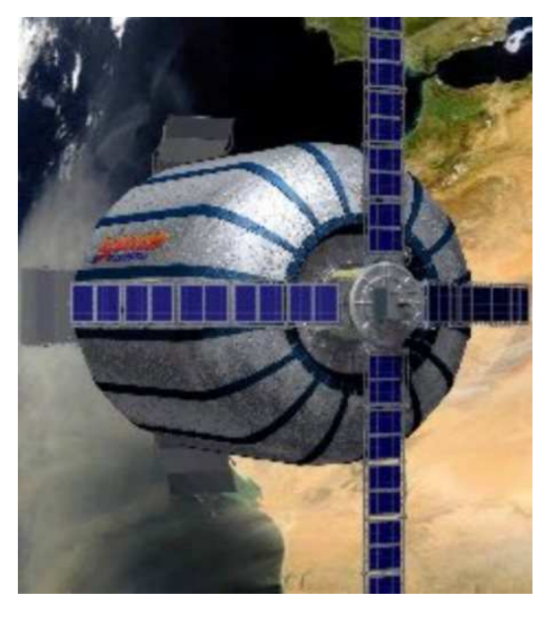
Fig. 4 – The Genesis-II inflatable experimental spacecraft is 4.4m x 2.4m in diameter [BigelowAerospace Document]

with improved acuity. At 05:04:40, I was able to catch the slightly hazy spot of light of Genesis-II as it was approaching Deneb of Cygnus, a good marker where I was waiting for it to appear, and I could follow the spacecraft for about 30 seconds with my naked eyes before I lost it. Great feeling. Thanks Bigelow Aerospace. And thanks Heavens-Above for the wonderful prediction charts."