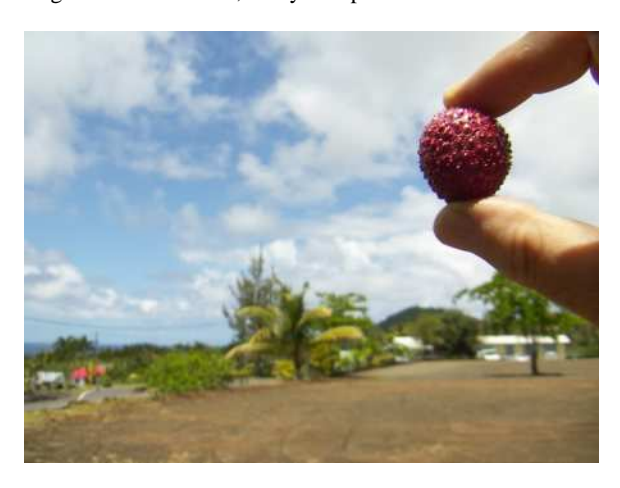
Fig. 2 – The Orbital Litchi in Sainte Rose, ready to begin a long journey to Las Vegas, Yasny, and Earth orbit...

The shell of the "Orbital Litchi" was cut in two halves, emptied from the prune and the stone, and reinforced with a thick inner coating of epoxy putty before the two halves of the skin were sealed together again. Then, in order to enhance the look under the cameras of Genesis-II, the litchi went through make-up, like any TV guest would do, and the reinforced shell was painted all over with a shiny and glittering finger nail lacquer to eventually become the original Orbital Litchi, ready for space.