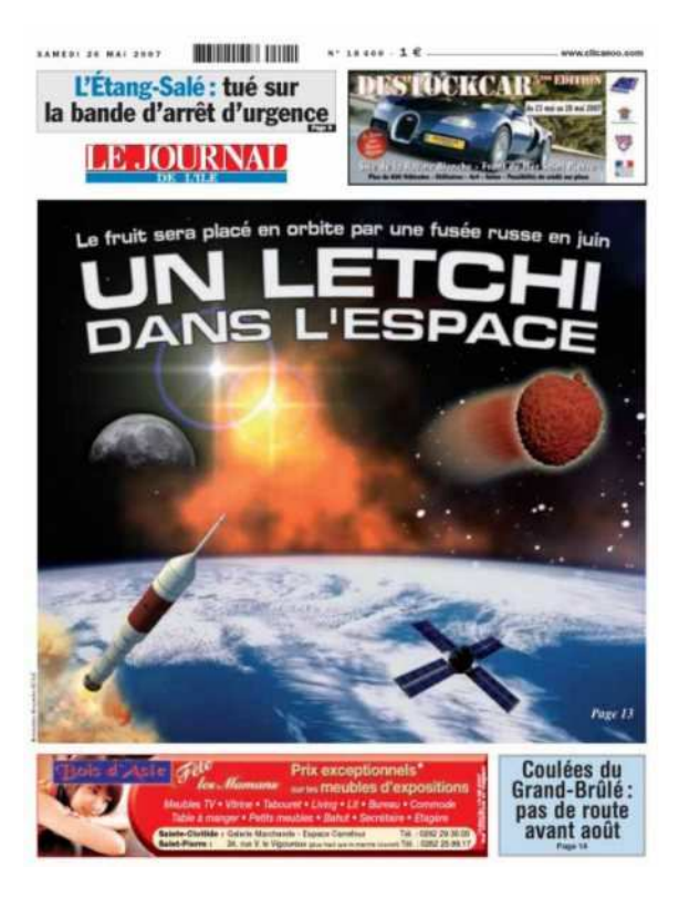
Fig. 5 – Front page of Journal de l'Île de La Réunion on the 26 May 2007.

other newspapers "Témoignages" and "Quotidien de La Réunion". The Orbital Letchi has appeared on regional TV networks with RFO and Antenne Réunion, as well as on many local radios. Some of the images and interviews presented by RFO were later broadcasted worldwide by the French satellite TV5 global network.