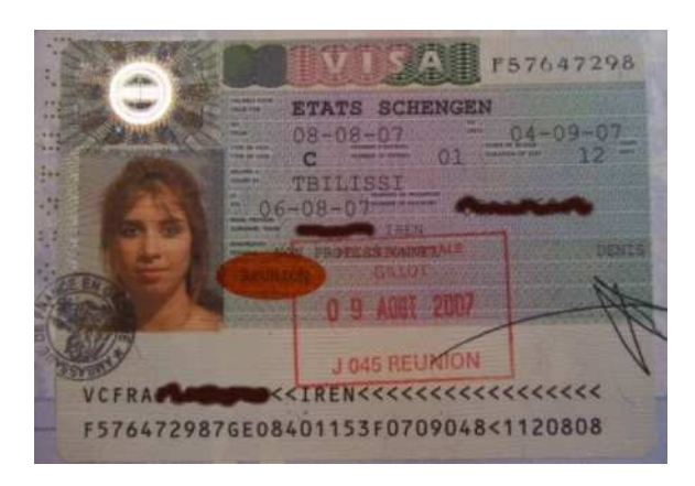
Fig. 13 – ... just to get a stamp to enter La Réunion. In the same time, the Orbital Litchi flew over a hundred countries.