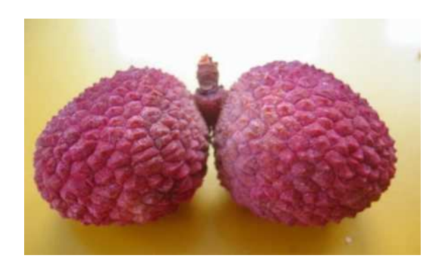
Fig. 1 - "Philippine" litchis, for making special dreams happen [ contribution by Meelane Charles ]

a typical tasty fruit from La Réunion where it had arrived from China in 1764. Litchis from volcanic Reunion Island, where they are called "letchis", are known to be among the best tasting in the world, and according to some experts, they might even have specific aphrodisiac properties.