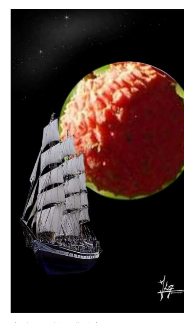
Fig. 8 – An original oil painting [contributed by Jean-Louis Gazaix]