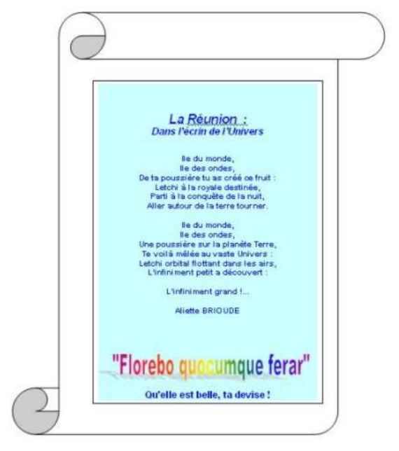
Fig. 6 – La Réunion in the jewel-case of the Universe A cosmic poem [ contribution by Aliette Brioude ]